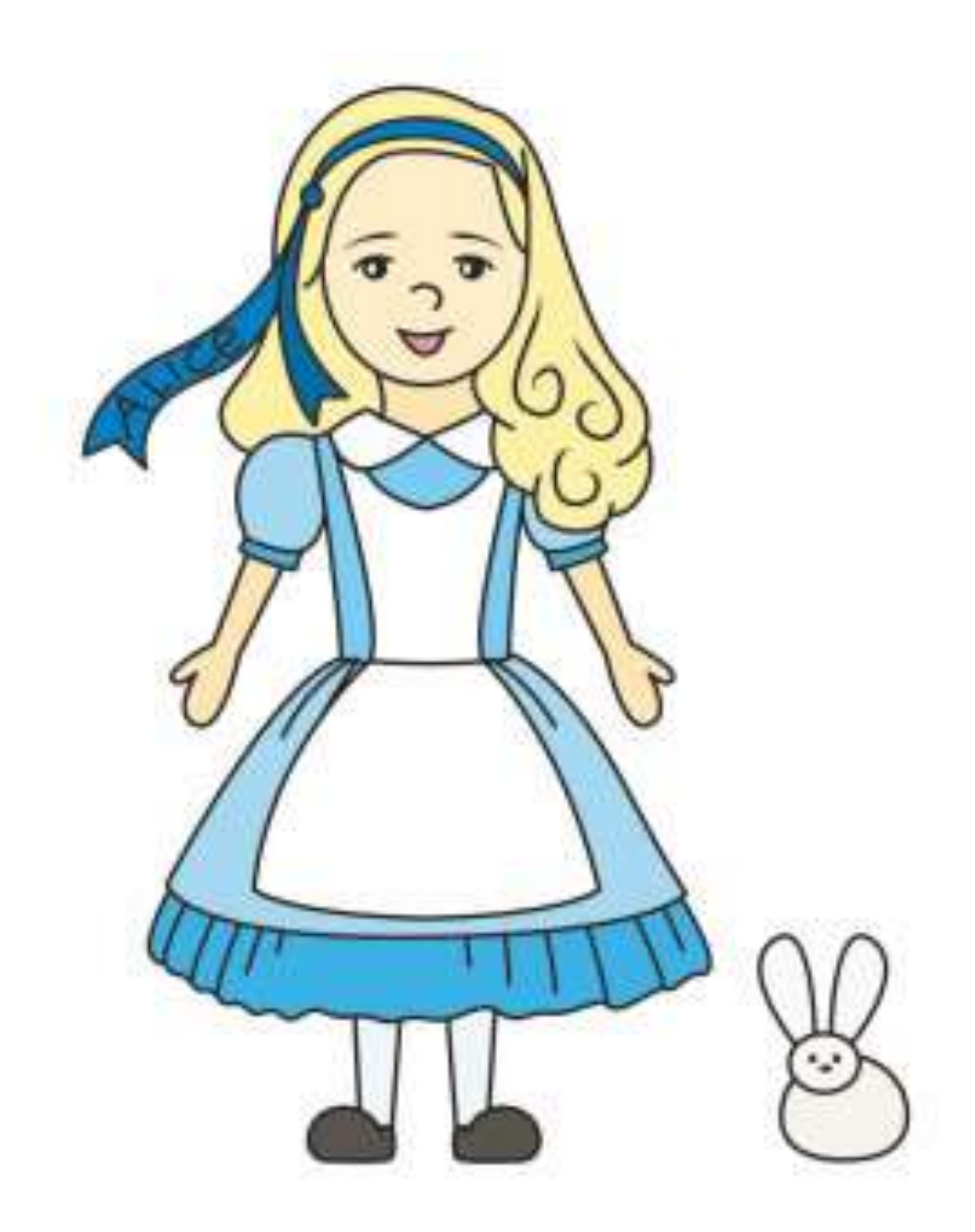
"I wonder if I've been changed in the night? Let me think. Was I the same when I got up this morning? I almost think I can remember feeling a little different. But if I'm not the same, the next question is 'Who in the world am I?' Ah, that's the great puzzle!"