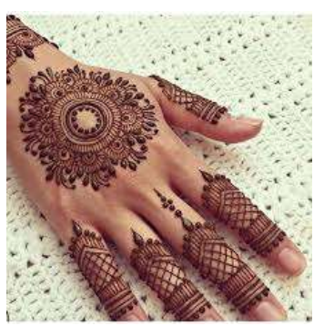
Design a Mehndi Pattern on this hand.