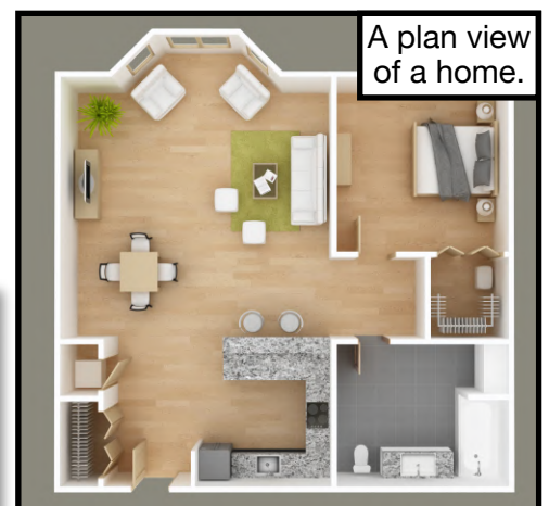
A plan view of a home.

Use the templates on the following pages to: 1. Create a picture to show what your house might look like from the outside, 2. Draw a plan view of the rooms and areas it will have on the inside.